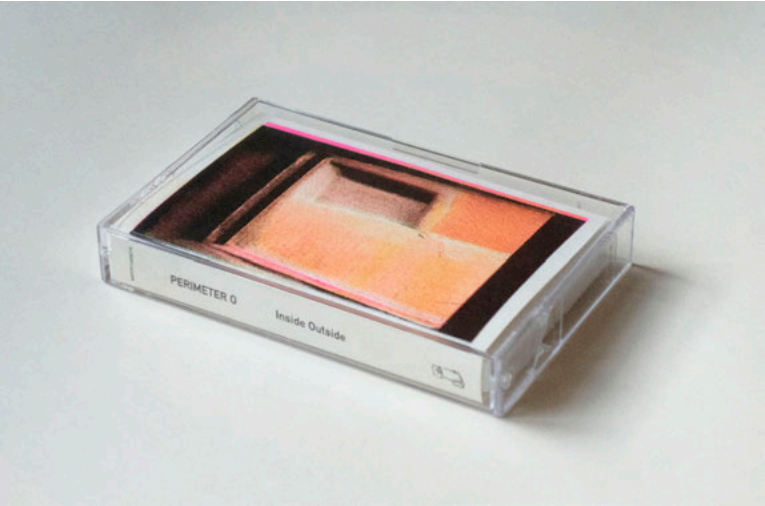
Pemille Meidell / Perimeter 0