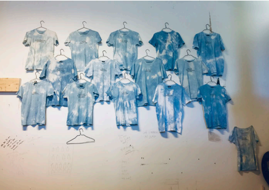
Vestemøy Lilleengen, Pottebla (Urine Indigo var)